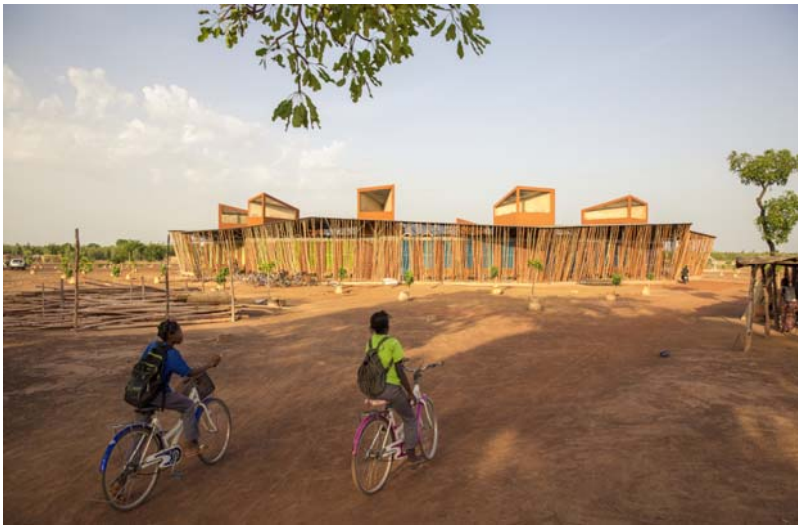
Francis Kéré »Lycée Schorge« in Koudougou, Burkina Faso, 2016