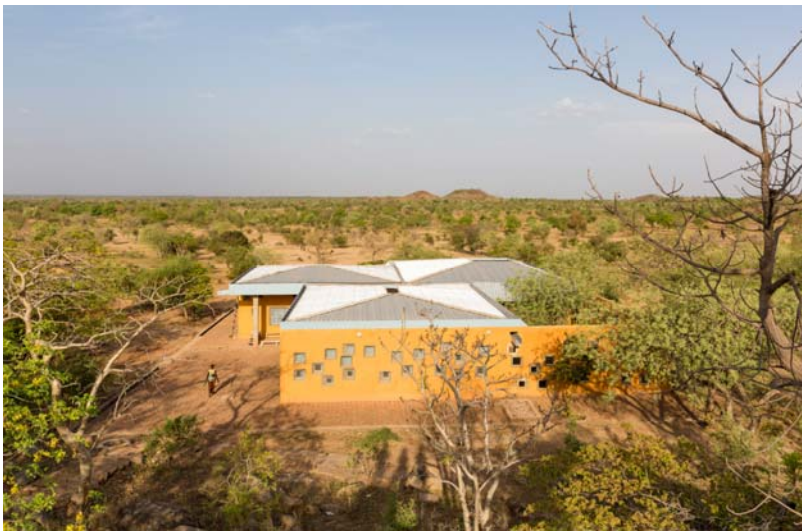
Francis Kéré Luftaufnahme des Centre de Santé et de Promotion Sociale, Operndorf, Laongo, Burkina Faso, 2016