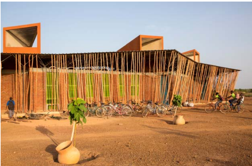
Francis Kéré »Lycée Schorge« in Kou-dougou, Burkina Faso, 2016