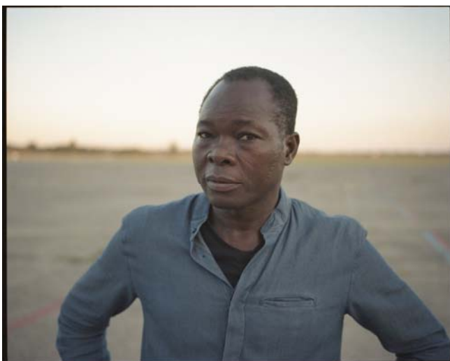
Francis Kéré Berlin, 2016