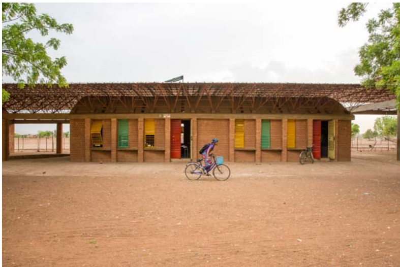
Francis Kéré Erweiterungsbau der Schule in Gando, Burkina Faso, 2016