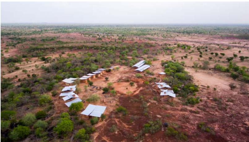
Francis Kéré Luftaufnahme des Operndor-fes, Laongo, Burkina Faso, 2016