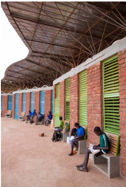
Francis Kéré Fensterläden und Sitzelemente im zentralen Hof der »Lycée Schorge« in Koudougou, Burkina Faso, 2016