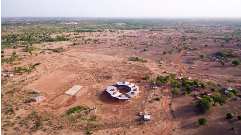
Francis Kéré Luftaufnahme des »Lycée Schorge« in Koudougou, Burkina Faso, 2016