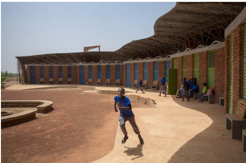
Francis Kéré »Lycée Schorge« in Koudougou, Burkina Faso, 2016