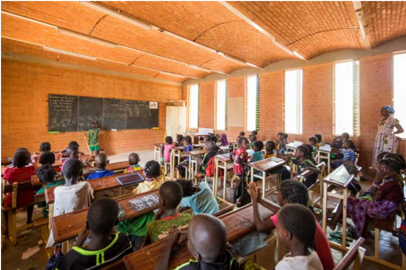
Francis Kéré Klassenzimmer in der Grundschule im Operndorf, Laongo, Burkina Faso, 2016