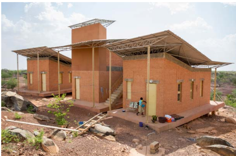
Francis Kéré Wohnanlage im Operndorf, Laongo, Burkina Faso, 2016