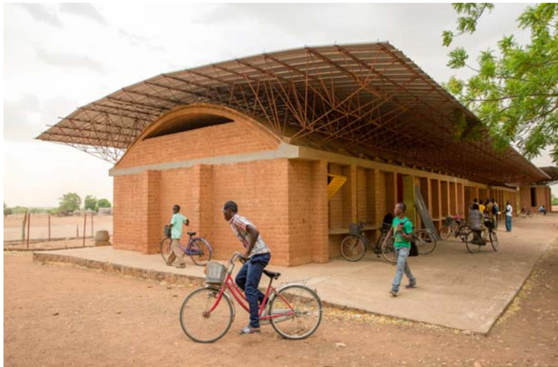
Francis Kéré Erweiterungsbau der Schule in Gando, Burkina Faso, 2016