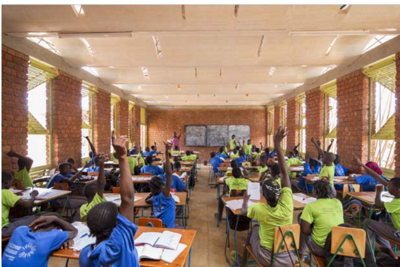
Francis Kéré »Lycée Schorge« in Koudougou, Burkina Faso, 2016