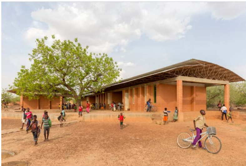
Francis Kéré Grundschule, Operndorf in Laongo, Burkina Faso, 2016